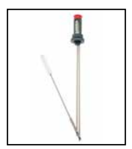
Level Gauge Mechanical swing-arm type level gauge for visual level monitoring. All plastic with PVC bushing Kynar® rods and HDPE float.