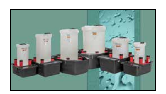
Mini-bulk containers with containment.

For larger stationary applications, Snyder offers the industry's broadest range of tanks – from 8 to 16,500 gallons – in shapes that meet your specific needs. To match your special function requirements, we also market a complete line of accessories, such as stands, seismic tie-downs, ladders, fittings, gaskets, sight gauges, heat tracing and insulation.