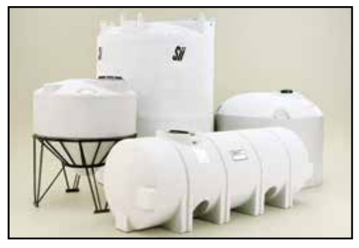
Stationary tanks store from 8 to 16,500 gallons.

Snyder intermediate bulk containers (IBCs) are durable, corrosion-resistant and economical. These long-term, reusable containers are ideal for the transportation of both hazardous and non-hazardous liquid materials.