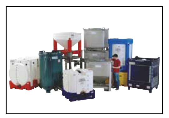
Transportation containers hold from 60 to 550 gallons.