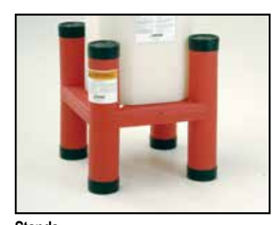
Stands Mini-Captor tank systems (35-275 gals.) can be mounted on elevation stands, creating more room for plumbing and other system requirements without utilizing additional floor space. Patent No. 7,059,575