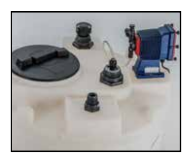
Other Fittings and Accessories All applicable Snyder Industries fittings and accessories can be integrated to complete tank system.